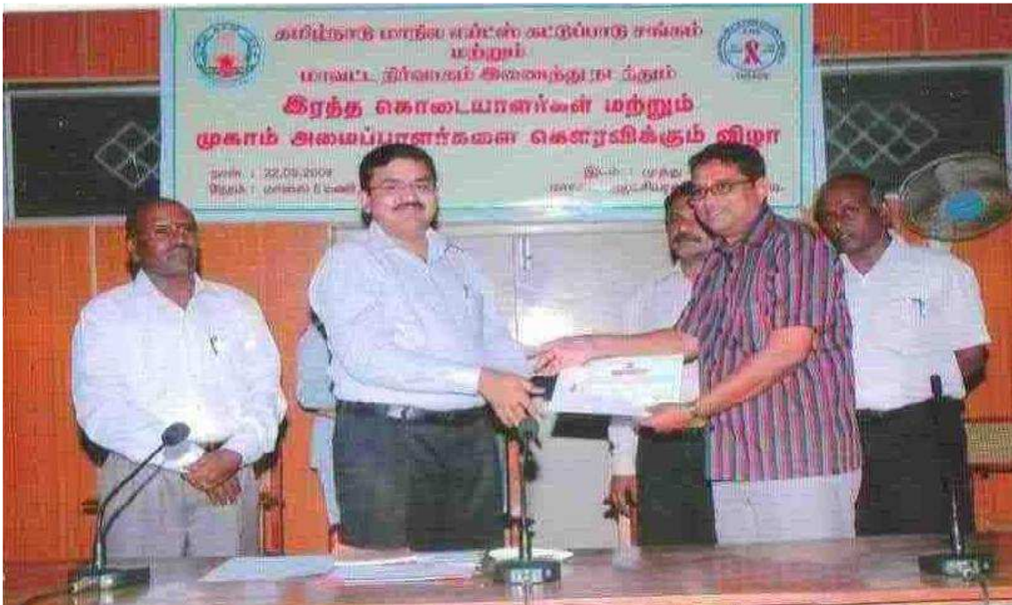
Award received from Tuticorin Collector for Blood Donation Camp for the year 2007 & 2008

He adds that there are warning signs elsewhere and they need to be read correctly — and acted upon. "Parts of Punjab and Haryana states may also be flooded in the near future after short spells of extreme rainfall and populations near the Ravi and Chenab may be affected."