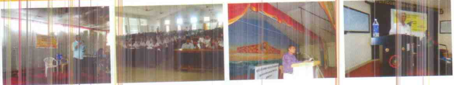
Special Counseling Programme to CPT Students