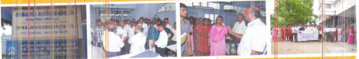
Career Counseling Programme at Walker Hr.Sec.School, Dohnavur