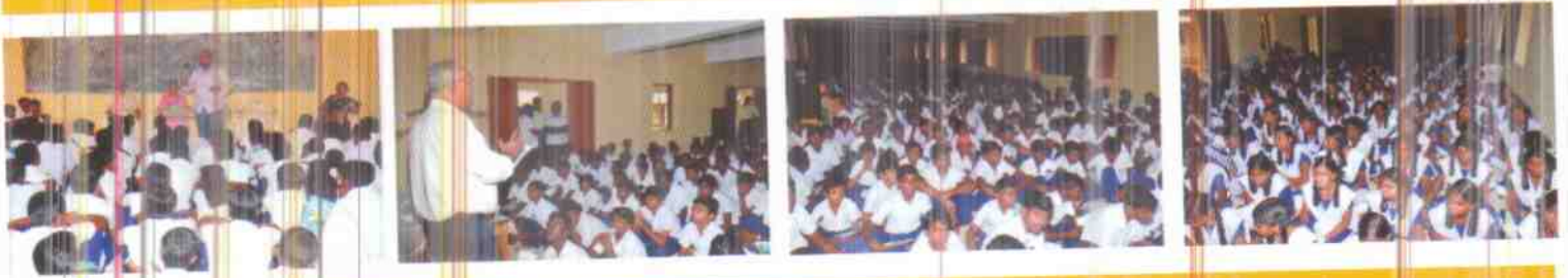
Visit of The Dohnavur Fellowship A Charitable body caring the orphan Child - 19.11.11