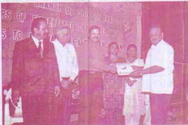
Students Project Submission on 10.07.2010 to VVD & Sons Pvt. Lt., Tuticorin

A three day Orientation programme for Chairmen, Vice-Chairmen and Secretaries of Branches of SIRC of ICAI was conducted by SIRC of ICAI at Kumarakom North, Kottayam from 22.07.2010 to 24.07.2010, and was attended by myself with the Vice-Chairman &