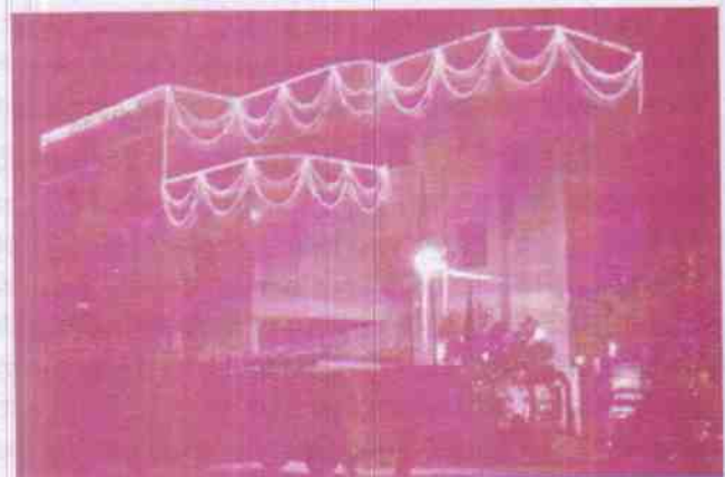
20 Years of Excellence-Tuticorin Branch on 10.07.2010