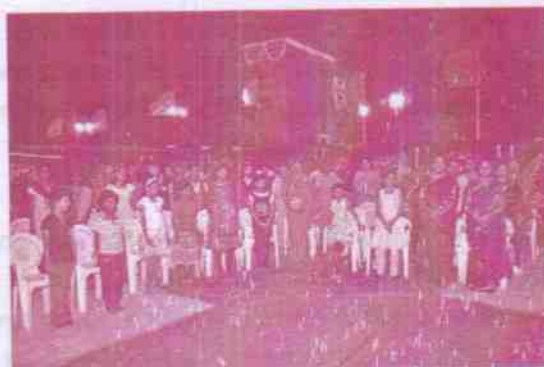
Family Get Together on 10.07.2010