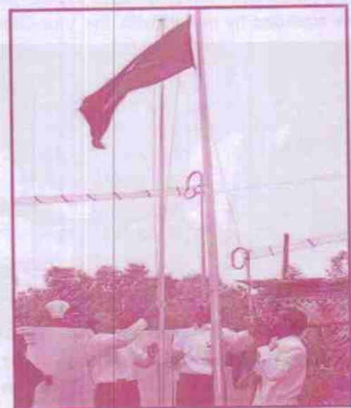
CA Day Celebration on 01.07.2010