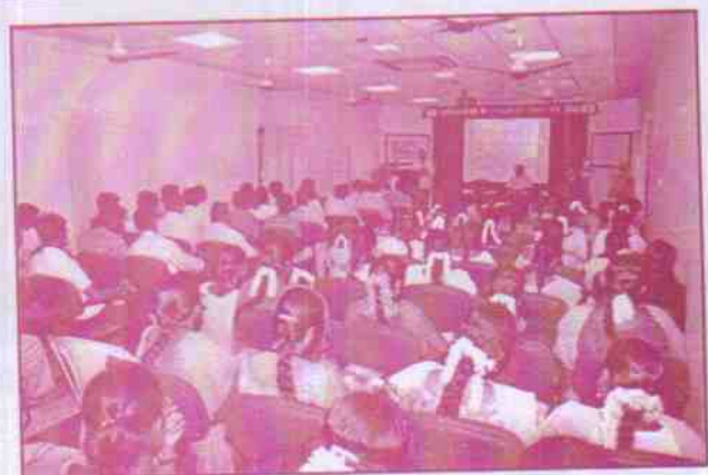
CPE Seminar on Easy Exit Scheme 2010 & Company Law Settlement Scheme 2010 on 29.07.2010