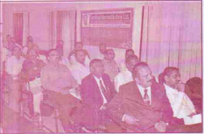
CPE Workshop on IFRS on 10 & 11.07.2010

The institute / Branch does not accept any responsibility for the views expressed in different contributions / Advertisements published in this Newsletter Published on behalf Tuticorin Branch of SIRC of ICAI, ICAI Bhawan, 4/26G/2, Aathiparasakthi Nagar, Ettayapuram Road, Tuticorin - 2.